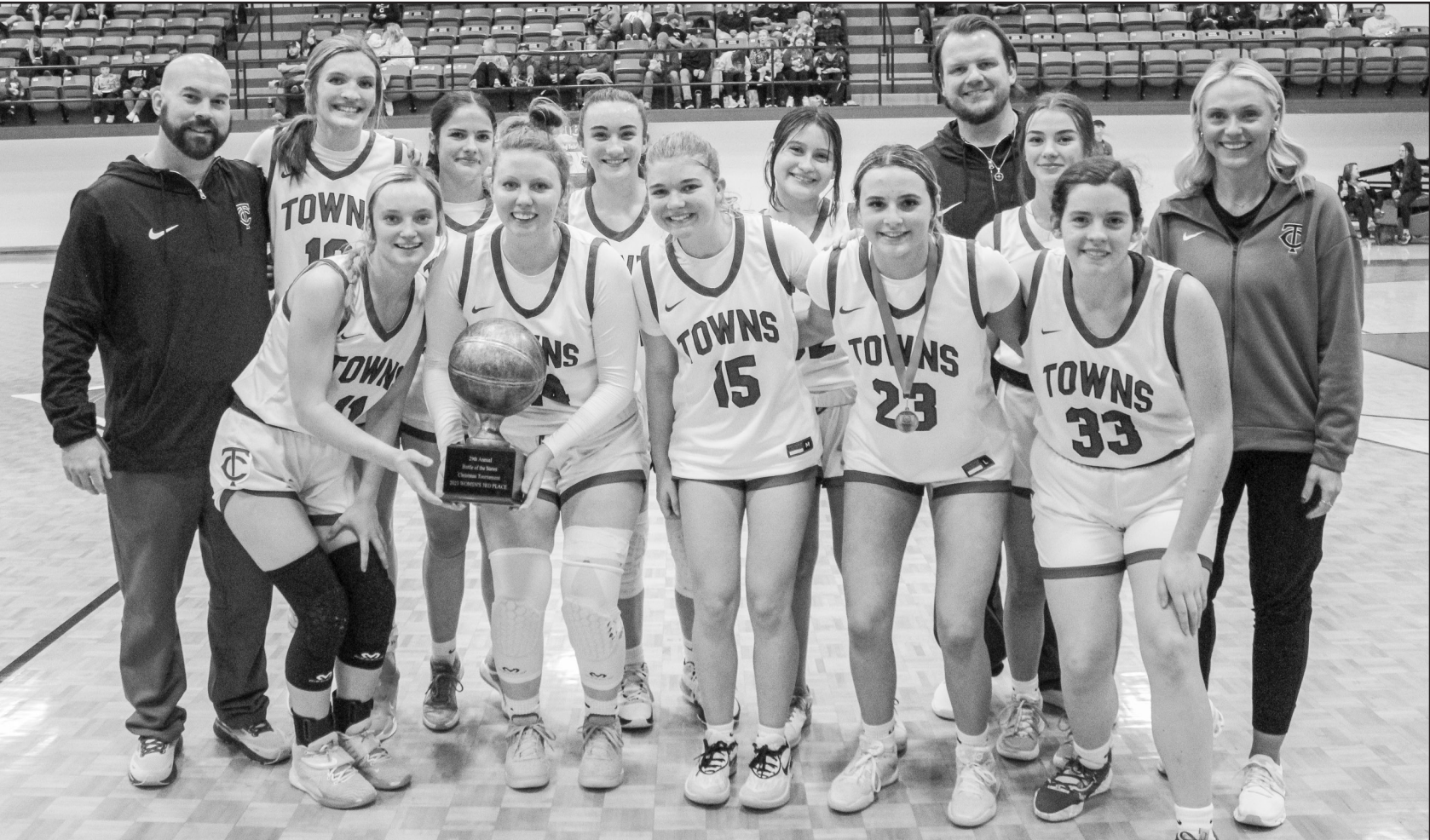
The Towns County Lady Indians finished third at last month's Battle of the States Christmas tournament following wins over Hayesville, North Carolina and Coosa. The Lady Indians' lone defeat came during the semifinals vs. No. 4 Rabun Counry.